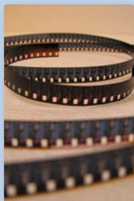
Focus on Local Young Filmmakers Thursday, May 3, 6:30 p.m.

Carlsbad City Library Schulman Auditorium 1775 Dove Lane 760-602-2022