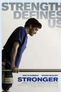
Stronger (2017, R, 119 min.) Wednesday, May 23

This true story chronicles the unique bond between marine corporal, Megan Leavey (Kate Mara) and military dog, Rex. Following their heroic tour in Iraq, Leavey fights to adopt and reunite with Rex.