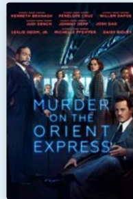
Murder on the Orient Express (2017, PG-13, 114 min.) Wednesday, June 27

Auggie enters mainstream school after years of homeschooling due to his facial deformity. His family is moved by his triumphs to create friendships amidst isolation and bullying. Auggie teaches them that instead of blending in, he can shine as himself.