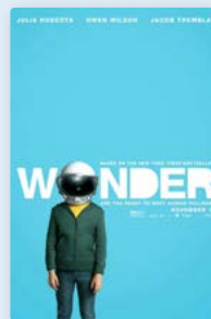
Wonder (2017, PG, 113 min.) Wednesday, June 20

Survivors of the 16th Infantry Regiment returned home to Kansas. Their adjustment to civilian life is challenged by the memories that haunt and threaten to shatter their lives.