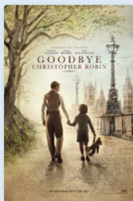
Goodbye Christopher Robin (2017, PG, 107 min.) Wednesday, May 30

Jeff Bauman (Jake Gyllenhaal) loses his legs in the Boston Marathon bombing. Bauman's tribulation and success during his recovery became a symbol of hope after a devastating tragedy.