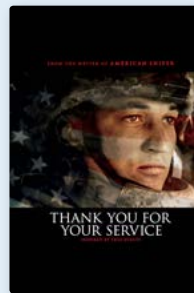
Thank You for Your Service (2017, R, 109 min.) Wednesday, June 13

Survivors of the 16th Infantry Regiment returned home to Kansas. Their adjustment to civilian life is challenged by the memories that haunt and threaten to shatter their lives.