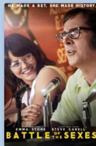
Battle of the Sexes (2017, PG-13, 161 min.) Saturday, May 5, 2 p.m., Free Cinema Chat begins at 1:30 p.m.

Carlsbad City Library Schulman Auditorium 1775 Dove Lane 760-602-2026