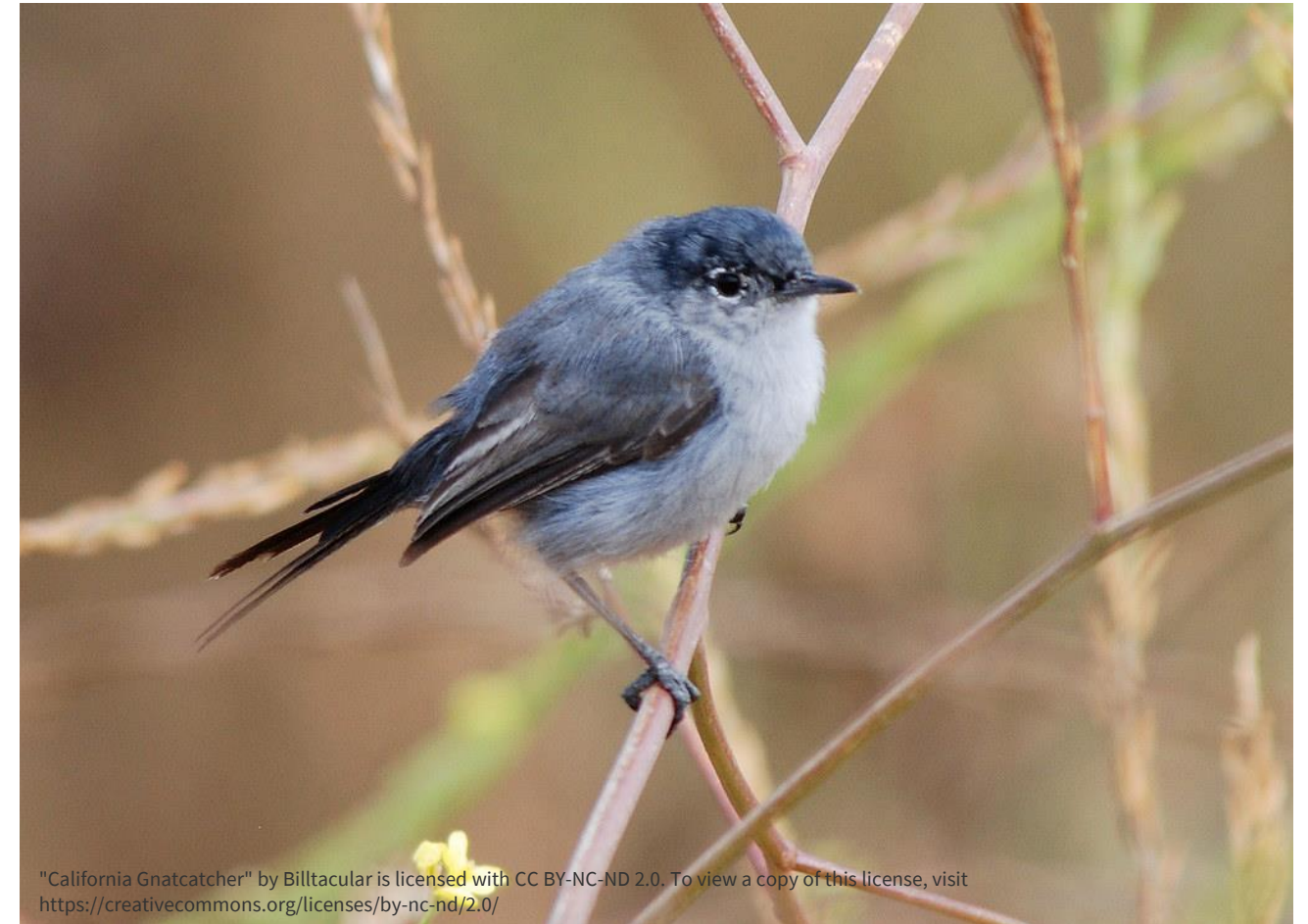
California gnatcatcher ( Poliioptila californica )