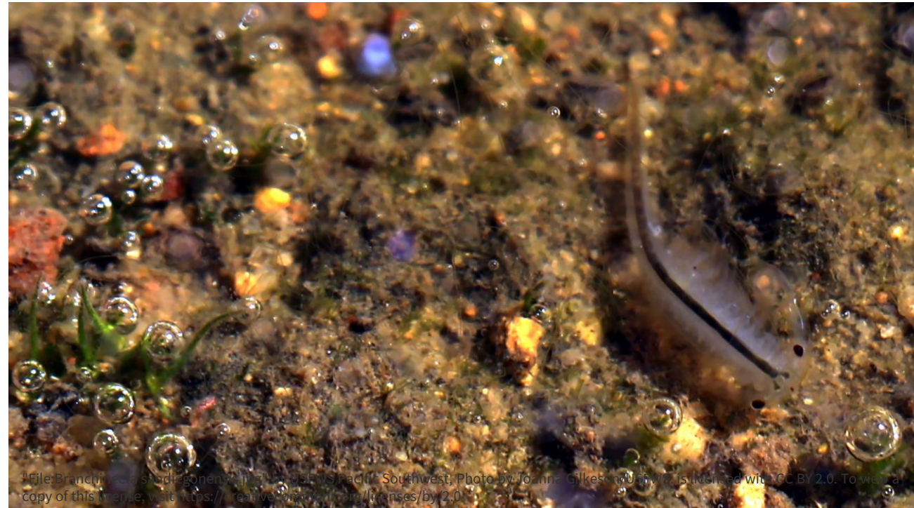
San Diego fairy shrimp ( Branchinecta sandiegonensis )